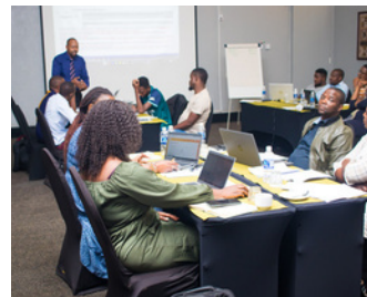
Hands-on learning for future M&E experts