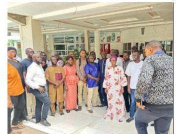
Leadership training for Presidential Delivery Unity in The Gambia