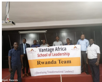
Developing skilled M&E practitioners to enhance project effectiveness