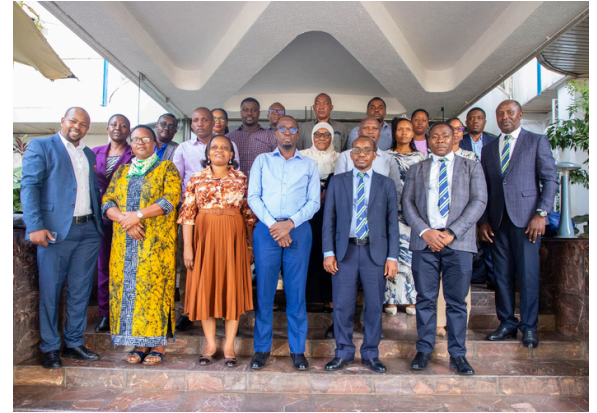
A team of senior government officials from Tanzania have just completed a one week training in Nairobi