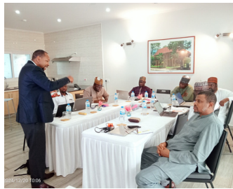
Inspiring leadership and innovation - Seychelles