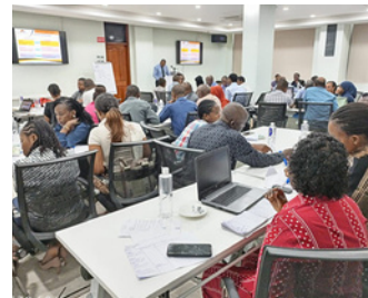
An interactive session in Tanzania