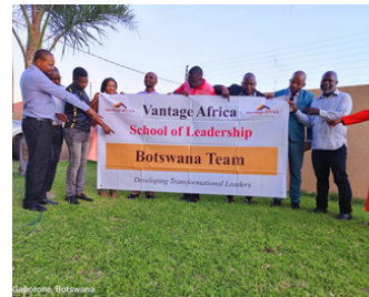
Leadership and innovation in action—Botswana edition