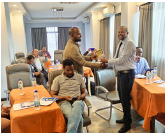
Developing skills, driving national progress-Ethiopia