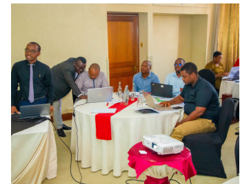
Measuring success, improving results—M&E in motion!