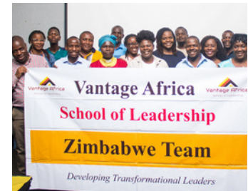
Knowledge that drives progress—training in Zimbabwe