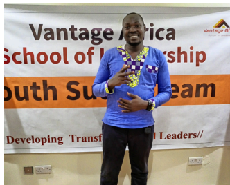
Leadership engagement - South Sudan