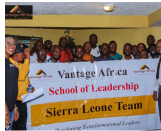
Building capacity for a brighter Sierra Leone