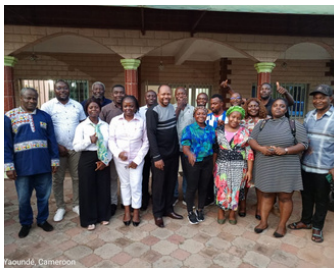
Professional growth in progress—Cameroon Training