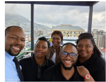
Empowering changemakers - South Africa