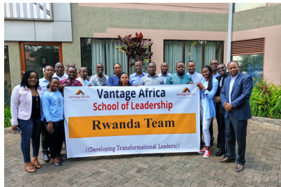
Participants pose for a photo after a successful M&E Training in Kigali, Rwanda