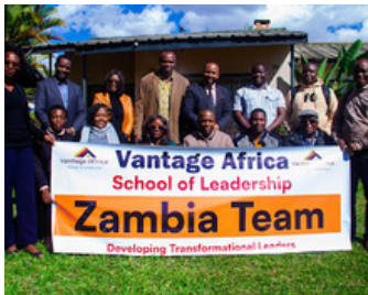
Developing visionary leaders for tomorrow - Zambia